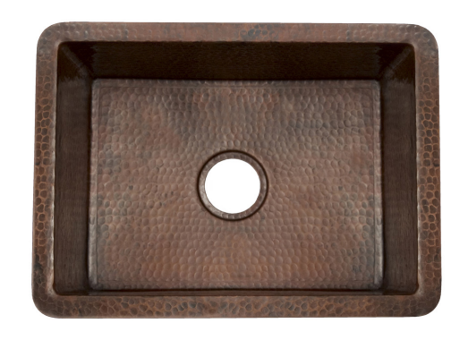
CPK278 Antique CPK578 Brushed Nickel